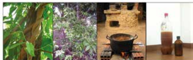
Figure 1. Ayahuasca preparation (from right to left): Banisteriopsis caapi ; Psychotria viridis ; ayahuasca decoction; ayahuasca prepared and bottled.

receptors (mGluR) 7,8 . DMT is an endogenous compound, although its physiological functions are not known 9,10 . There is some evidence that endogenous DMT could act as a neurotransmitter on sigma receptors 11,12 , but human studies suggest that the psychoactive effects of classic/serotonergic hallucinogens such as lysergic acid diethylamide (LSD), psilocybin and DMT are mainly mediated by the 5-HT 2A receptor 8,13-15 .