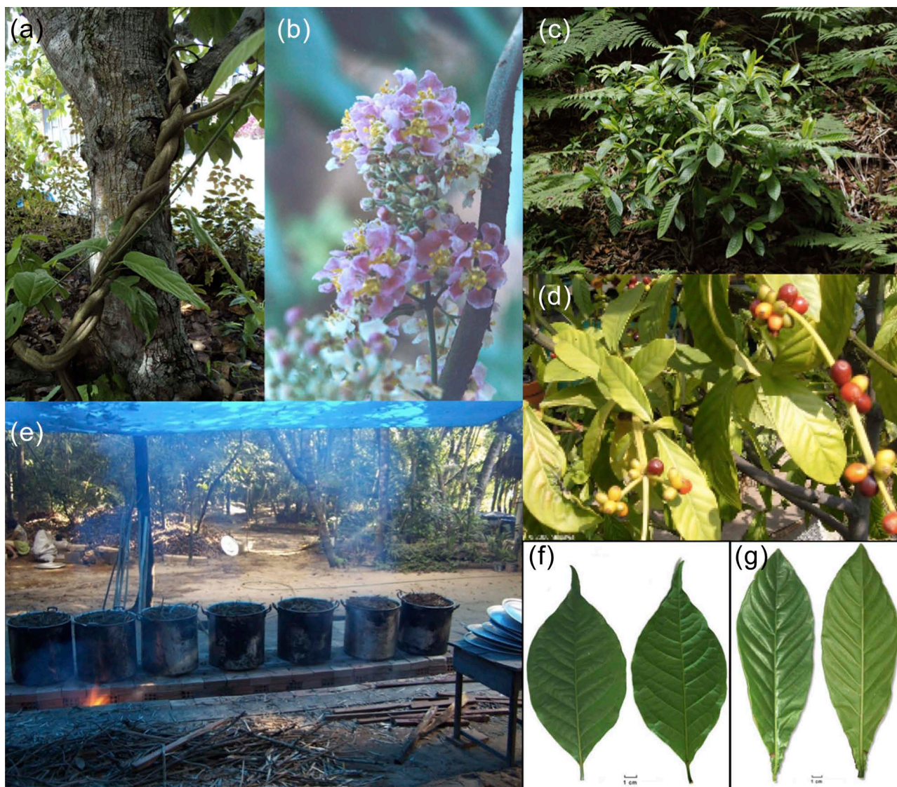
Figure 1. (a) B. caapi growing in front of a tree, (b) B. caapi flowers, (c) P. viridis shrub, (d) P. viridis leaves with fruits, (e) preparation of ayahuasca brew at a community in Alter do Chão, Pará, Brazil, in February 2010, (f) detail of B. caapi leaves, and (g) detail of P. viridis leaves.

a Please note that the Quechua term Ayahuasca ( aya = spirit, ancestor; and waska = vine) is largely employed, sometimes referring to B. caapi alone, sometimes referring to all forms of the preparation, including some that use only B. caapi .