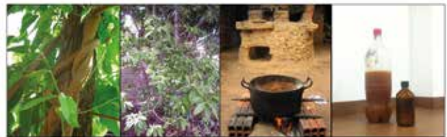
Figure 1. Ayahuasca preparation (from right to left): Banisteriopsis caapi ; Psychotria viridis ; ayahuasca decoction; ayahuasca prepared and bottled.

receptors (mGluR) 7,8 . DMT is an endogenous compound, although its physiological functions are not known 9,10 . There is some evidence that endogenous DMT could act as a neurotransmitter on sigma receptors 11,12 , but human studies suggest that the psychoactive effects of classic/serotonergic hallucinogens such as lysergic acid diethylamide (LSD), psilocybin and DMT are mainly mediated by the 5-HT 2A receptor 8,13-15 .